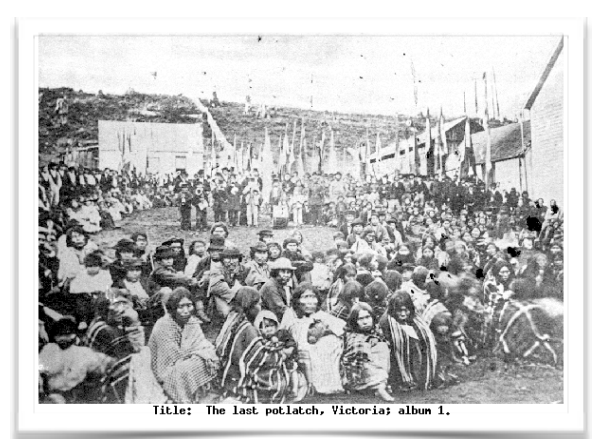
Potlatch in Victoria

Did you know ......the word potlatch is Chinook and means to give? Potlatches were (are) significant ceremonial occasions that were held in the winter months when food and resources were abundant having been gathered and preserved during the rest of the year. Potlatches were significant social, political, economic and ceremonial foundations of a community