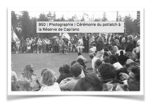
Squamish Potlatch 1954

The Federal Government of Canada outlawed the Potlatch in 1885. The Potlatch